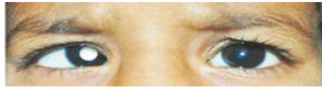
A white reflection in the pupil