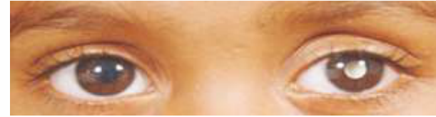
A squint eye with white reflection in the pupil